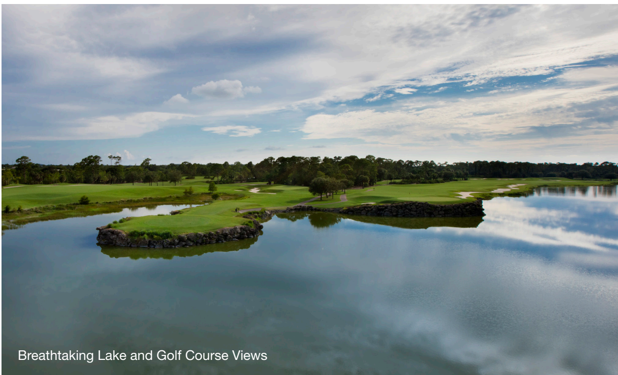
Breathtaking Lake and Golf Course Views

Place your priority reservation today by calling 239-778-9574.